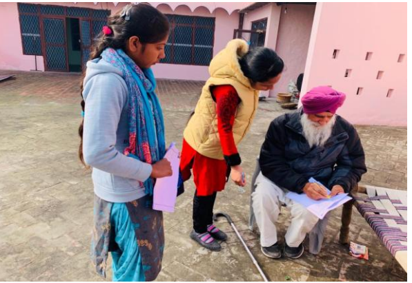
VOLUNTEERS DURING SURVEY WITH LOCAL RESIDENT