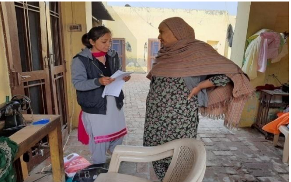
VOLUNTEERS DURING SURVEY WITH LOCAL RESIDENT