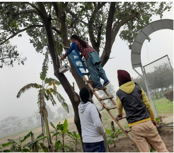
WATERING TO PLANTS AND NEST BUILDING BY NSS VOLUNTEERS